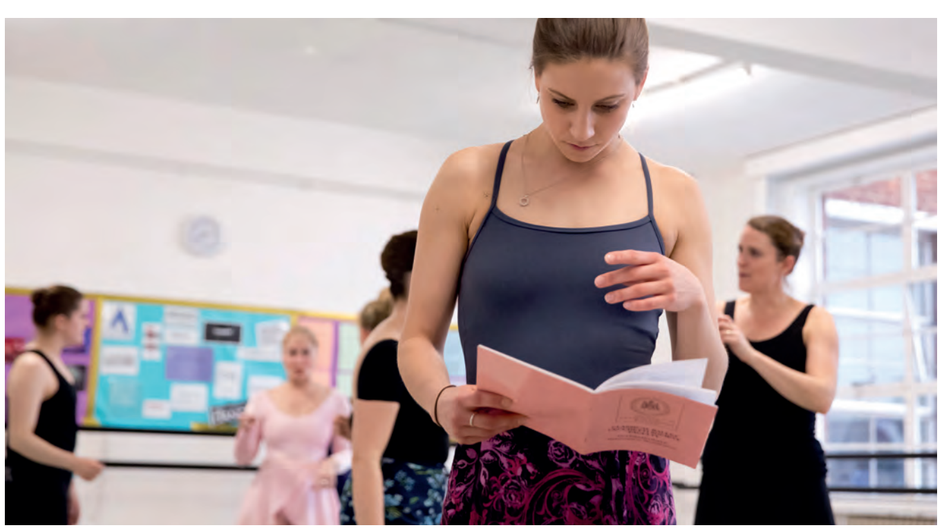
Spring Programme 2019

Please note that pianists are required for Imperial Ballet and Cecchetti vocational exams. CDs may be used for all graded and class examinations.