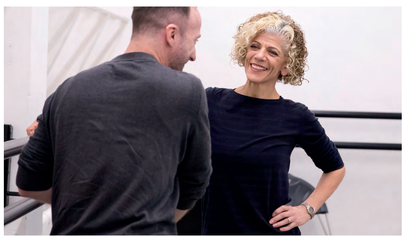
Spring Programme 2019