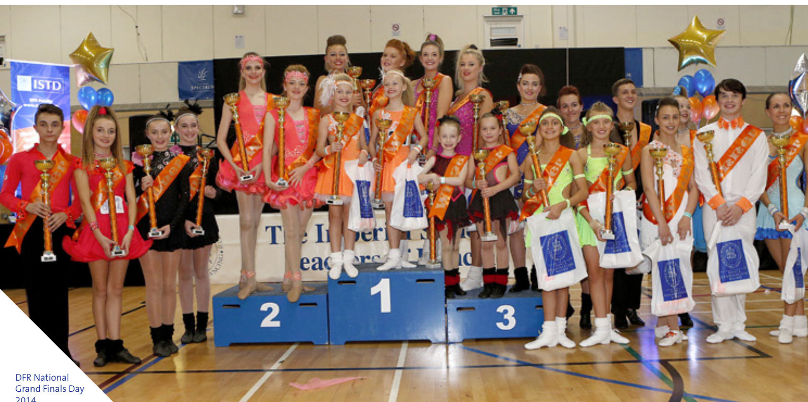
DFR National Grand Finals Day 2014