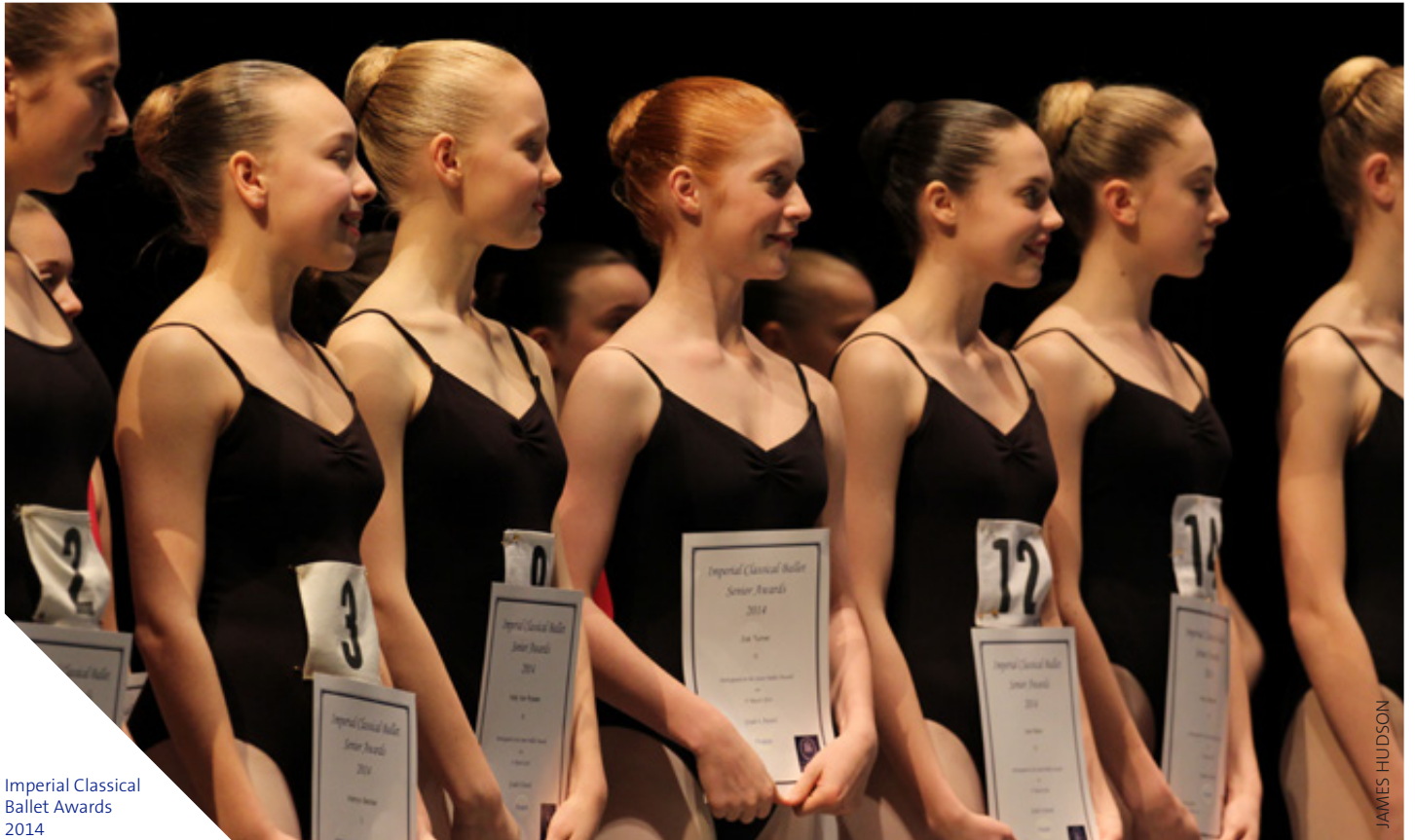
Imperial Classical Ballet Awards 2014